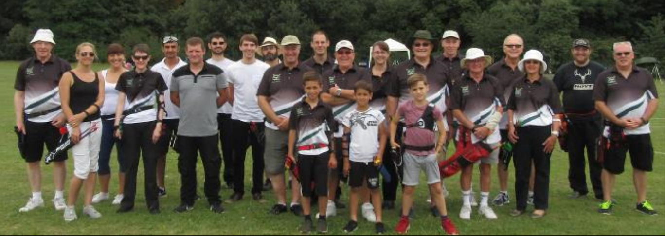
It's that time again ..

The renewal forms are all with clubs. Indeed some have already been filled in and sent to me which is great. Some points to help all clubs:-